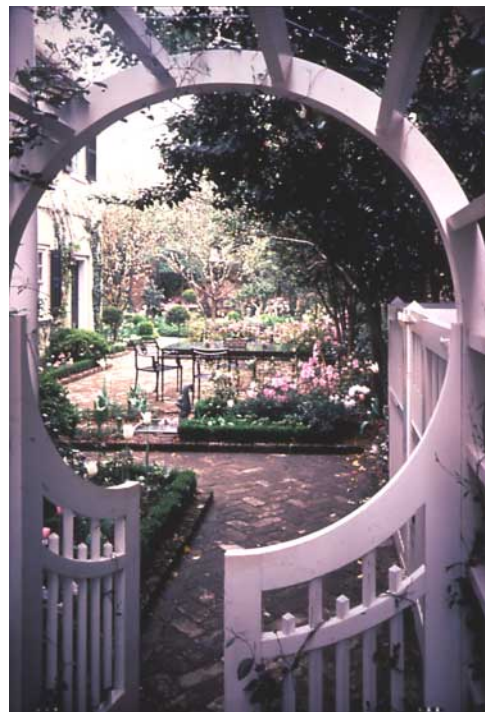
SPECIAL/ALEXANDER L. WALLACE

But don't fret if you don't have the time or money for elaborate accents, she said. Even something as simple as a child's footprints on a stepping stone can be an effective way to tell your story. "The point is to