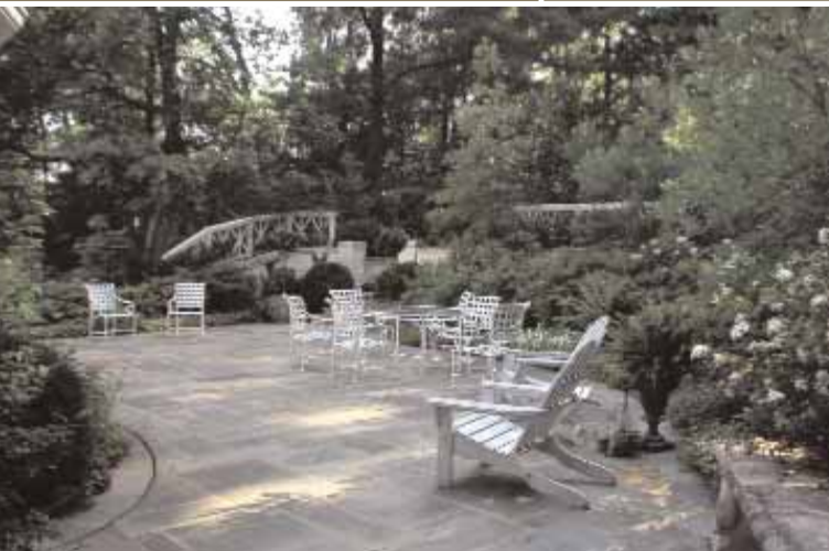
LEFT: A medium-size terrace can serve many functions and has room for plantings as well as seating for a small group.