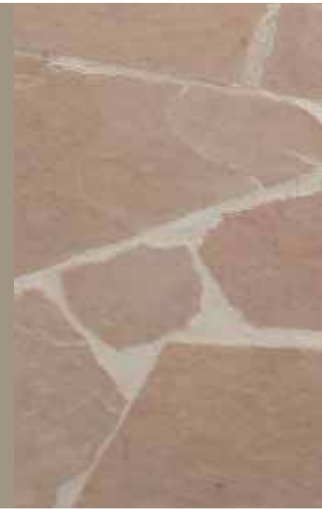
LEFT: Irregular Crab Orchard stone is finished with a buff mortar. Shades of buff and peachy beige were chosen to complement the warm tones of the house.

Natural stones that are set as “flags,” or stepping-stones, should be at least three inches thick to support the weight of foot traffic, especially when laid directly on the soil.