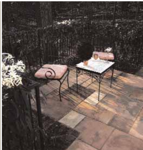
ABOVE RIGHT: A small terrace floored with Crab Orchard stone seats two comfortably.