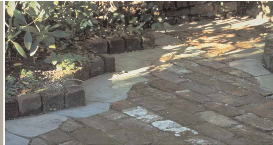
RIGHT: A brick field with irregular blue-stone edging is contained by a brick sailor hedge.