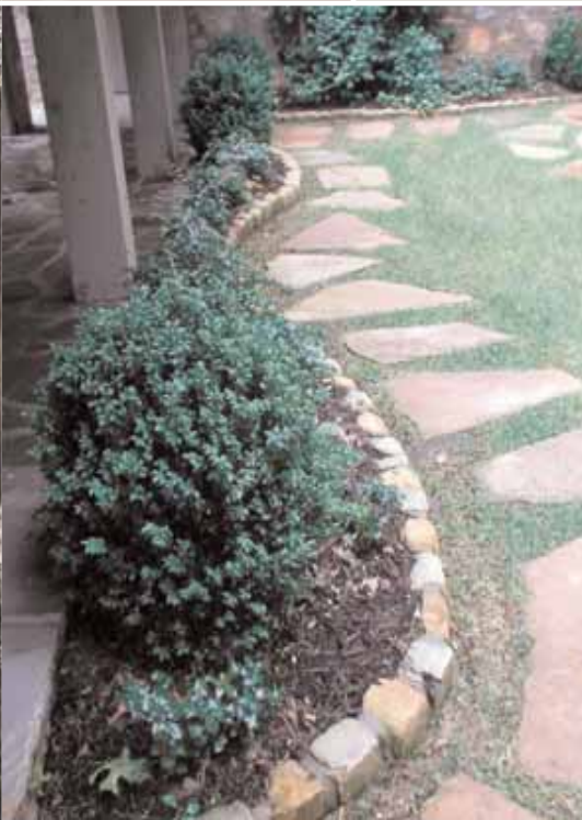
FACING: Limestone set in random ashlar pattern.