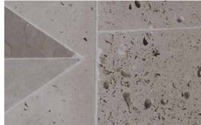
Exquisite jointing and cutting of Texas cream shell stone, New York bluestone and gray Crab Orchard stone.

While there are no formulas for choosing and combining materials, consider the following: